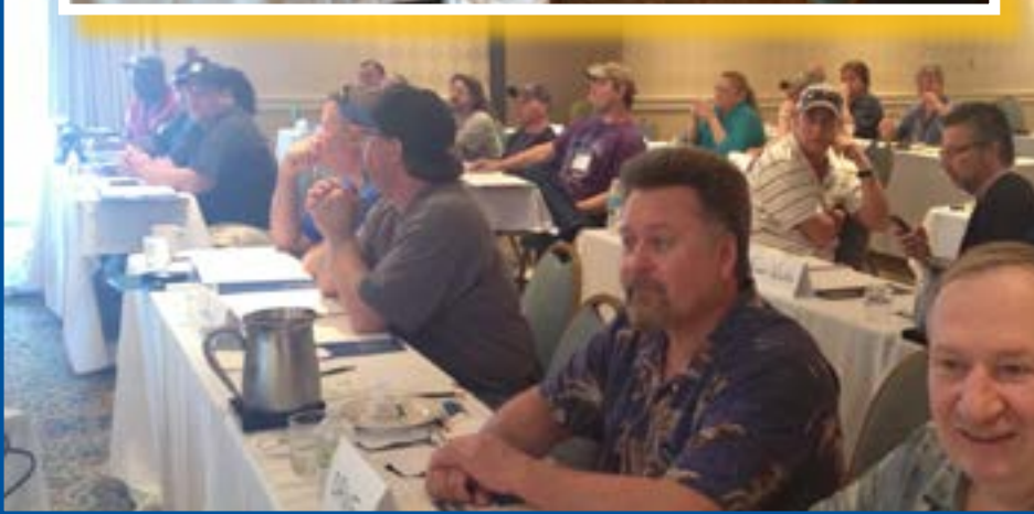
Officers and Stewards ready to kick off morning training.