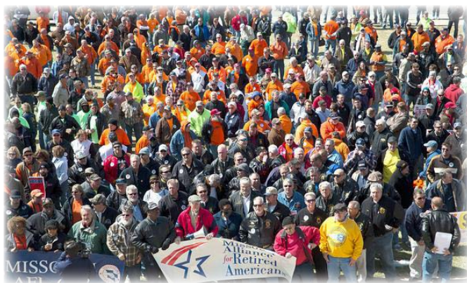
Thousands gathered at the Missouri Capitol in March to protest "right to work" legislation, which was later defeated.

Extremist groups have been attempting to advance "right to work" legislation across the country. The latest attacks have come in Missouri, Kentucky and Ohio. Fortunately, union activists and our allies have been successful in pushing back against these corporate-funded attacks on working people. In Kentucky, "right to work"