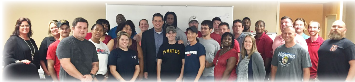
IUE-CWA and CWA members came together in Indianapolis for a boot camp training - these activists are fighting back for working families in Indiana.