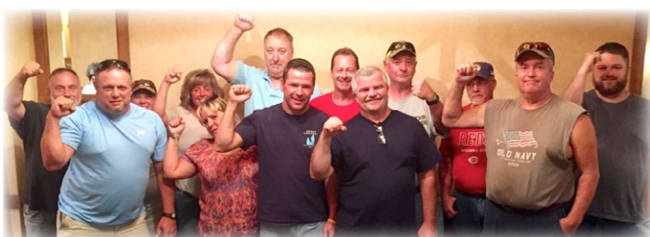
Non-union Workers at the Momentive Plant in Hebron, OH